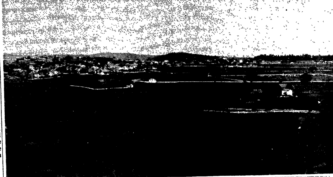
Gettysburg's dimensions have enlarged considerably in the last 90 years as these two photographs show. Today there are more streets, houses and even trees than in the 1880s when the older photograph was made. Yet, clearly, the ageless hills retain their same recognizable outline. The courthouse tower and clock, near the left of each photograph, makes it possible to orient oneself. In the older picture, West Middle Street runs diagonally from left to right where it is bordered by the white rail fence.